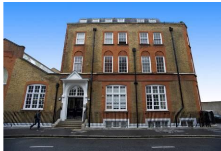
Set in a converted London school house