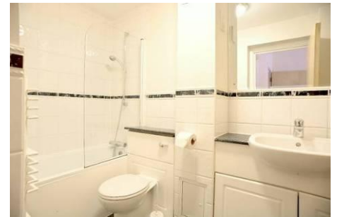
The main bathroom