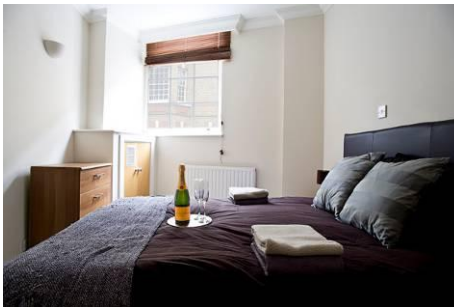
Main bedroom with en-suite