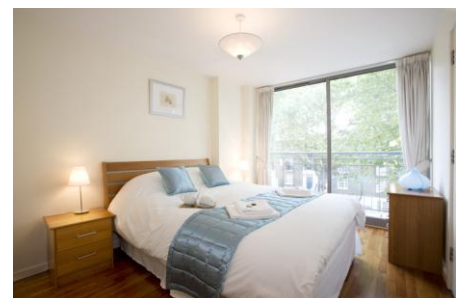
The Waterloo Apartment bedroom