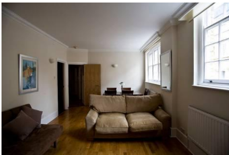
Free fast broadband