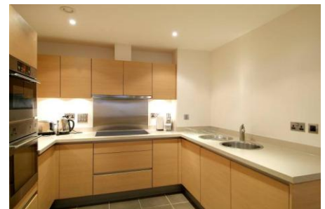
The St James' Apartment Kitchen