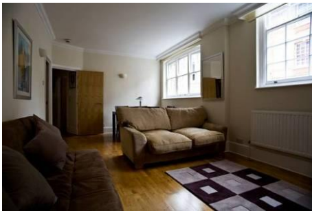
Bright living room

We are very proud of this spacious and bright central London apartment